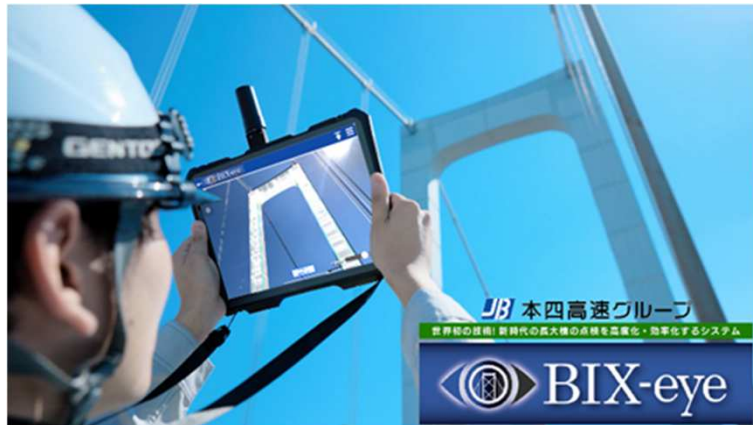
Overlaying Camera image of the Main Tower with the BIM Model

Honshu-Shikoku Bridge Expressway Company Limited